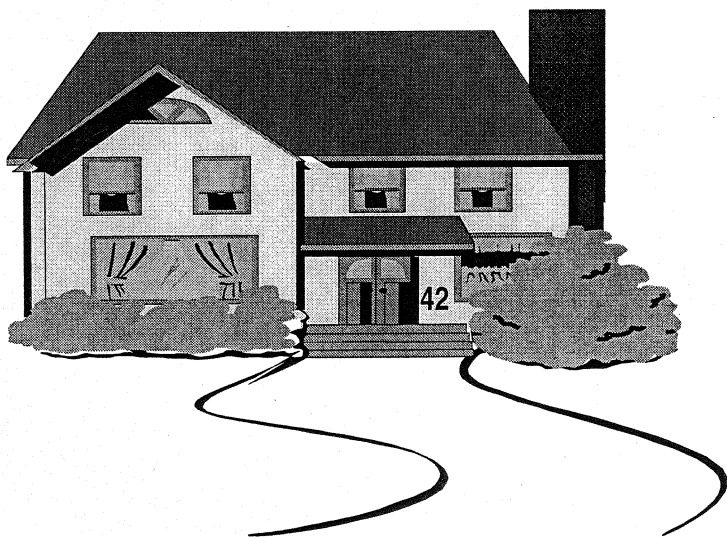
Residence on street

Numbers on Residence (Min. 3" high x 2 1/2" wide reflective)